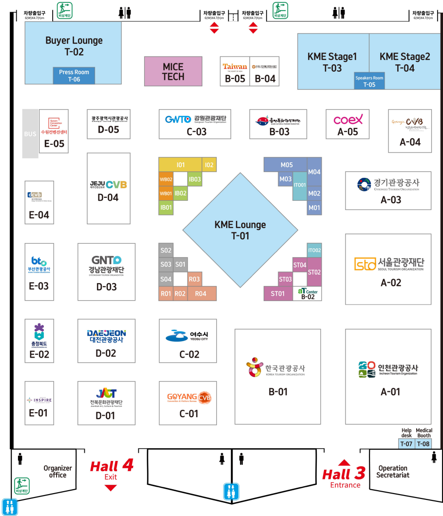
Exhibition Hall Lobby